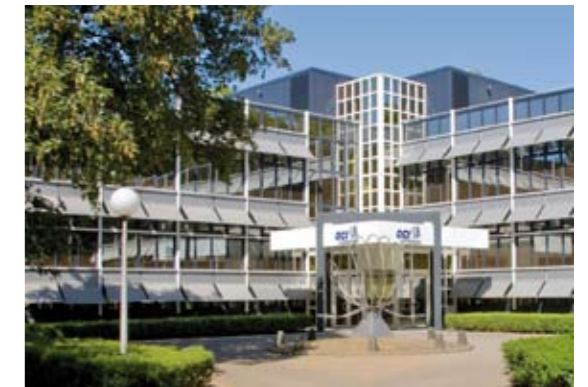
Our head office in Geleen

The head office of OCI Nitrogen is located in Geleen (the Netherlands). Production plants of OCI Nitrogen are located in the United States, Indonesia, and China, as well as in the Netherlands (Geleen).