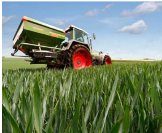
Spreader with an edge spreading device

The products degrade readily in the environment, but are harmful to aquatic organisms. For this reason, prevent them from entering or polluting surface water. Furthermore do not spread any fertilizers at the edges of fields: this can cause a reduction in biodiversity.